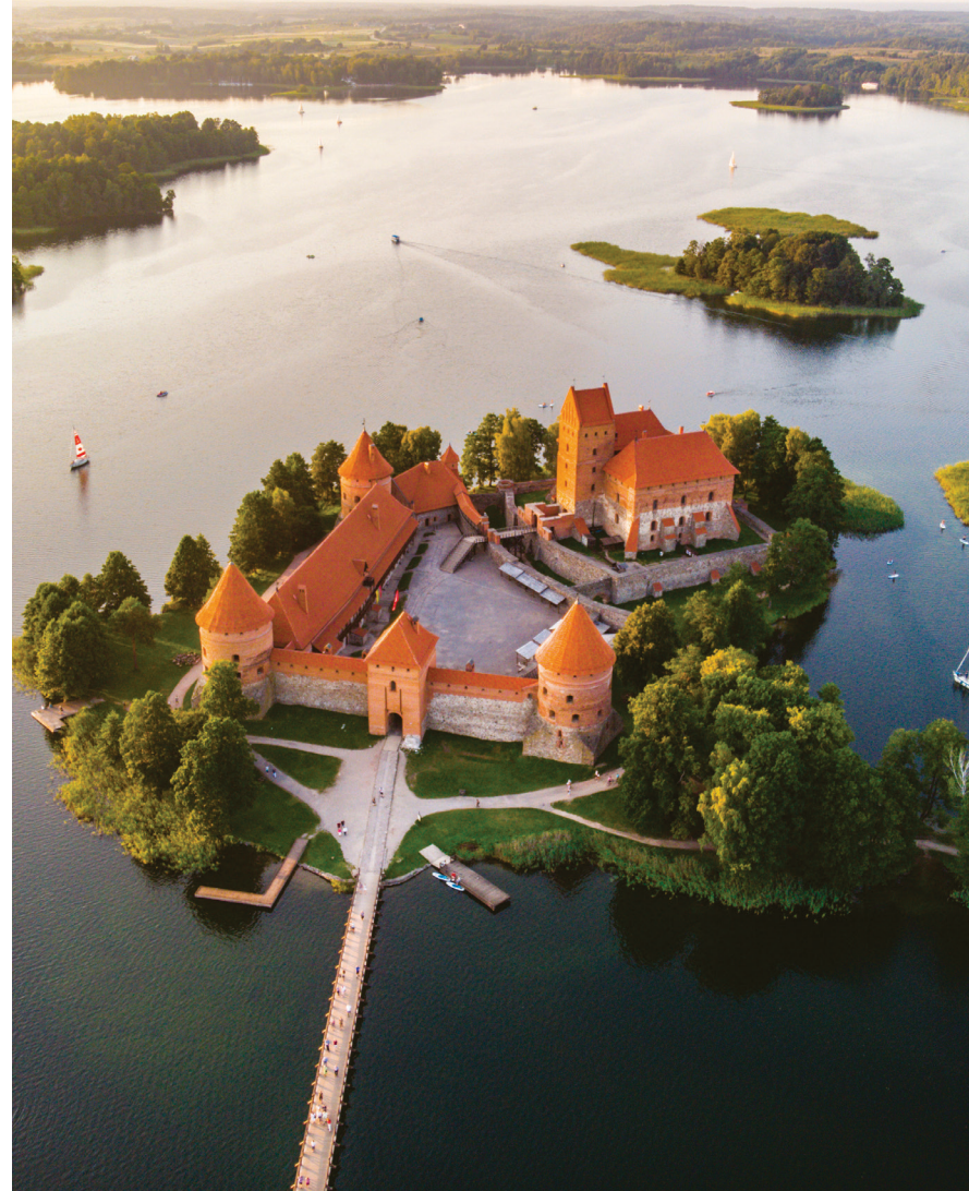
Trakai island castle

This place known for its impressive landscape and the legendary Trakai Castle, was a cradle of Lithuanian statehood, an important military and political center. The castle is famous for its gothic architecture and its special location – it stands on an island on Lake Galve, one of the deepest lakes in Lithuania and is the only Eastern European castle built on an island. It is believed that its construction started at the end of the 14th century. The view of the historic structure is straight out of a fairy tale. You can reach the castle by crossing the long wooden bridge and visit the museum inside to explore the exhibitions of the Grand Dukes of Lithuania, various archaeological findings as well as a collection of art. In the summer there are medieval festivals as well as various events and concerts in the castle's courtyard. Trakai resort area encompasses the natural resources for medical and wellness travelers such as a fine climate, pure air, green forests and lakes. All year round it is bustling with activity where visitors and locals enjoy fitness, health procedures, concerts and cultural attractions.